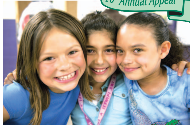
Christmas Appeal on Page 6

We are grateful to all of you for your on-going support. Thank you for helping your neighbors in need.