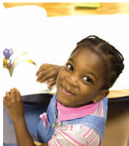
AFCAAM of Catholic Charities in Fort Myers

Today in Lee County, we are helping young mothers whose babies need clothing, diapers and other material needs. The Baby Room in the Clare House building of Catholic Charities serves these struggling young families who are trying to make a better tomorrow for their toddlers and newborns.