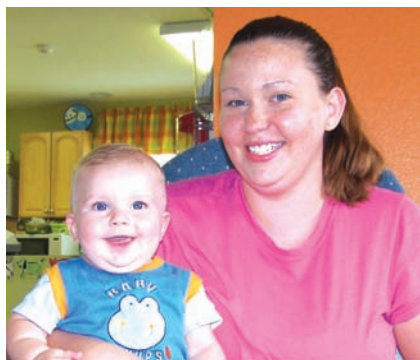
Our Mother's House of Catholic Charities in Venice

These brief descriptions are of only a few of our many programs and services that you support through your gifts to the Christmas Appeal.