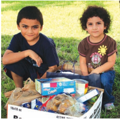
Catholic Charities of Lee County