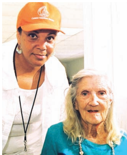
Laura Sikes/Catholic Charities USA