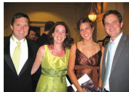
Couples enjoyed the 2008 Emerald Ball in Naples.

Please come and support Catholic Charities in your community! Everyone is invited.