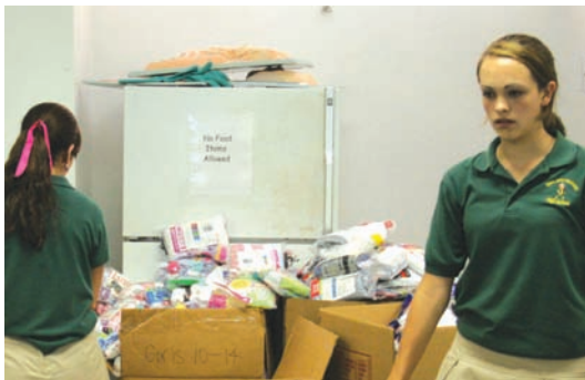
Diocese of Venice

Due to the past successes of the annual Undy Sunday drive, Catholic Charities of Collier County has received financial donations. The agency plans to utilize these funds to purchase