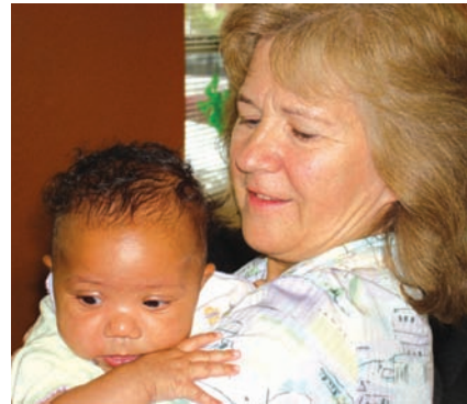
Our Mother's House of Catholic Charities in Venice.

At Our Mother's House of Catholic Charities in Venice, a single, homeless mother and baby seek shelter and services. Required classes in budgeting and parenting help her learn to live independently.