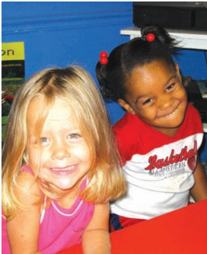
St. Martha's Early Learning Center in Sarasota.

These brief descriptions are only a few of our many programs and services that you support through your gifts to the Christmas Appeal.