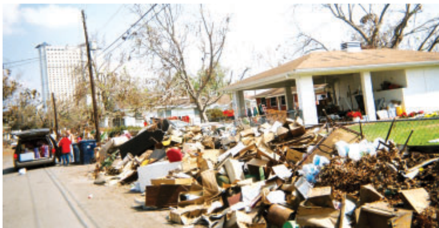
Hurricane Katrina destruction in Biloxi, Miss.