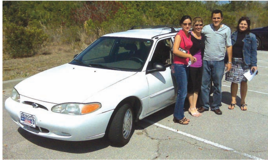
Cuban family with the “little white car.”