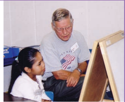
Catholic Charities...We Care on pages 7-8

Thank you for supporting these vital programs.