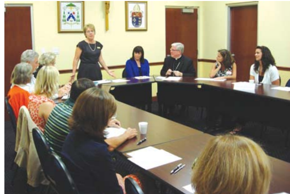
Event Chairs of Catholic Charities fundraisers attended an all-day seminar at the Catholic Center in Venice.

Events on Page 5 of this newsletter for more information on all Catholic Charities fundraisers.