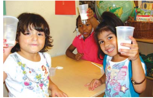
Students at St. Martha's Early Learning Center receive a healthy breakfast, lunch and afternoon snack.