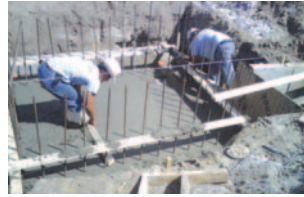
Rising up from the ground...