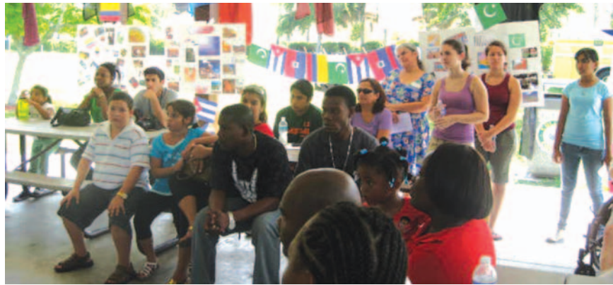
Refugees enjoy World Refugee Day event.

Refugee programs of CC—in Fort Myers, Naples, Sarasota, Venice—are always in need of items to assist the refugees who