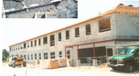
to the roof in Port Charlotte.