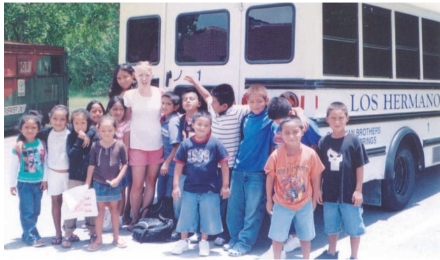
Summer campers gather next to one of the Christian Brothers buses before a field trip.

This year marks the fifth year Notre Dame students have