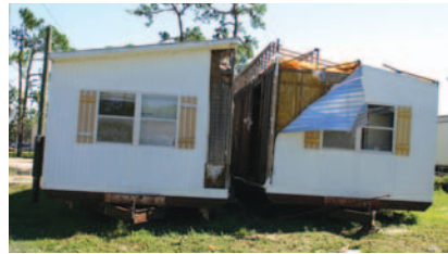
Hurricane Wilma was especially devastating to residents of mobile homes, such as this one in Immokalee.