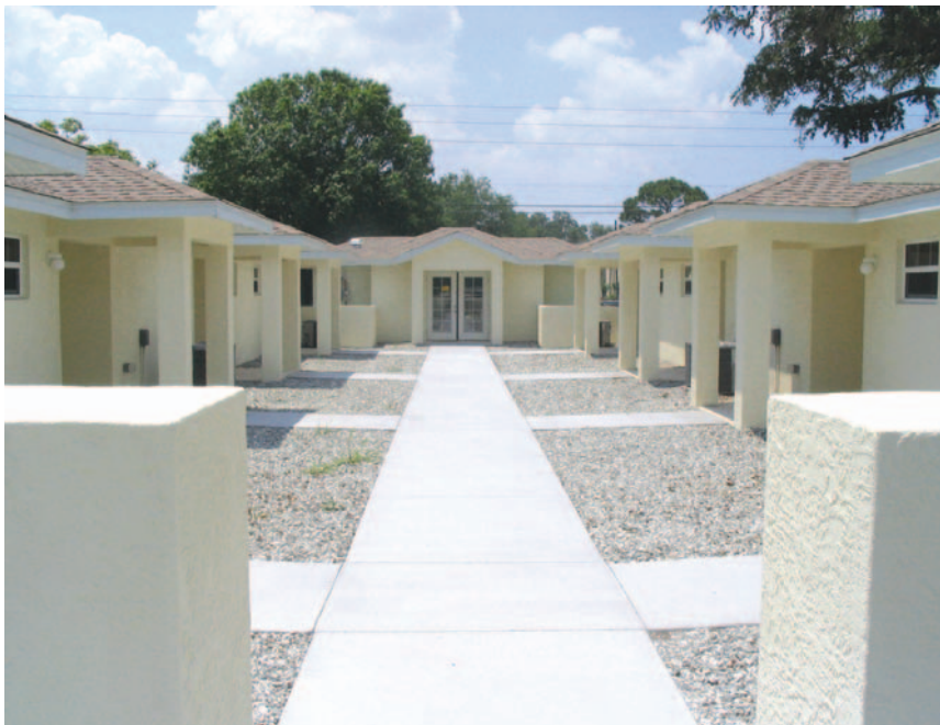
The courtyard of Casa San Jose, the new housing program of Bethesda House of Catholic Charities in Sarasota.

For any organization, group or individuals wishing to donate to Casa San Jose, contact Bethesda House at 941-366-1886.